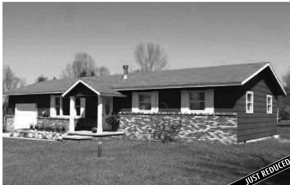
975 S INTERMEDIATE LAKE RD, CENTRAL LAKE