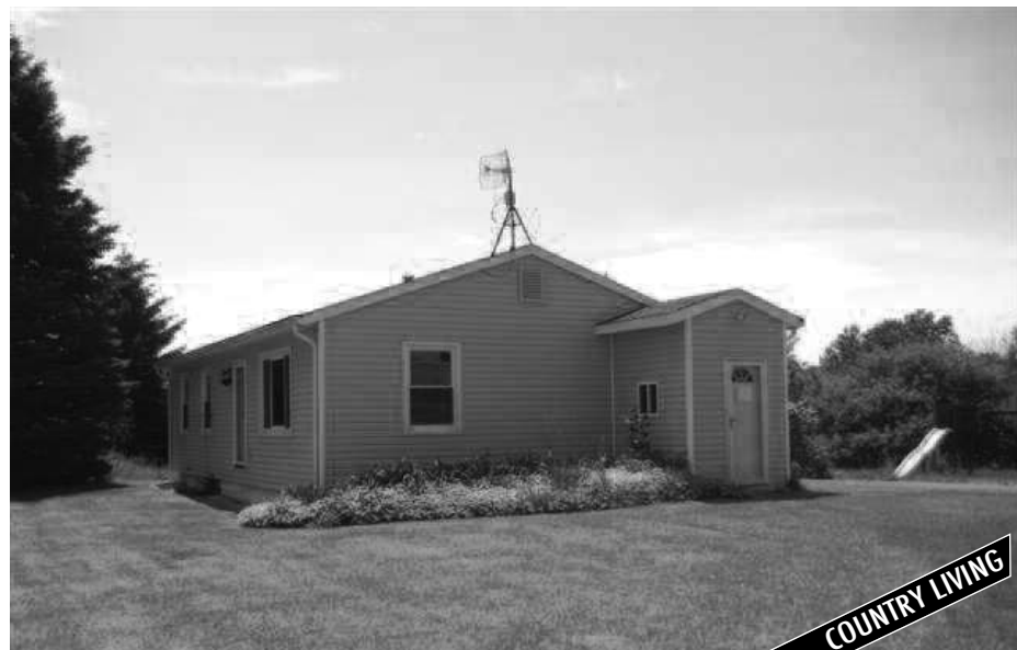
3083 BLACK RD, CHARLEVOIX Great little ranch ... $75,550

A short walk from Intermediate Lake public access. Brand new roof on 6/15/12, new appliances, flooring, counter tops, large bath with ceramic shower. Beautiful views from the front and the back of this pretty ranch. MLS 432630. Ask for Mike Stark.